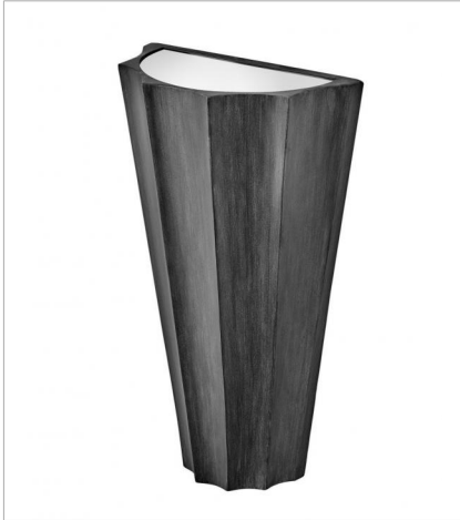
34092BGR TWO LIGHT SCONCE 10" W, 17" H LED Lamp 2-6w GU10 LED *Included

FINISH: Brushed Graphite GLASS: Etched Lens