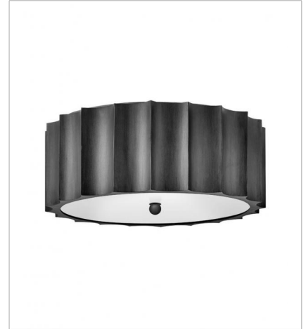
34098BGR LARGE FLUSH MOUNT 24" W, 9" H Socket 4-60w Med.